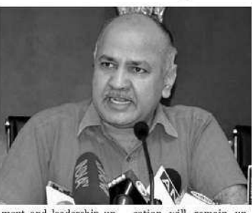
Deputy Chief Minister Manish Sisodia speaking at a podium during a meeting.

Staff Reporter New Delhi Deputy Chief Minister Manish Sisodia on Friday said schools have to expand their role to make education a mass movement and school heads now need to play the role of education leaders and engage the community with the school so that the learning environment is not confined to the school's boundary wall. He said this during the interaction with the school heads that there is a need for our school heads to take education in Delhi to a new dimension by sharing the experiences and best practices of their schools amongst themselves. A Cluster Leadership Development (CLDP) program was organized for the professional develop-